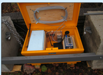
• Noise and vibration monitoring station