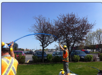
• Multipoint borehole extensometer