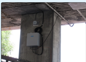
• Highway 40 column tilt monitoring