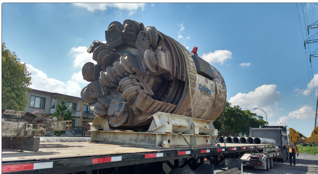
• Tunnel boring machine head

The Jarry Tunnel project stems from a decision by the City of Montreal administration to secure the domestic water supply for critical sectors of the city. Part of the project involves installing a conduit of 1200 mm in a tunnel of 4.1 km under Jarry Street and 24 th Avenue. In the fall of 2015, GKM Consultants was mandated to provide and install geotechnical instruments to monitor ground and existing structure movements during and after the tunnel boring machine went through. In addition, GKM was to assist with monitoring and control of noise and vibration caused by the work done on site as well as supply autonomous monitoring stations.