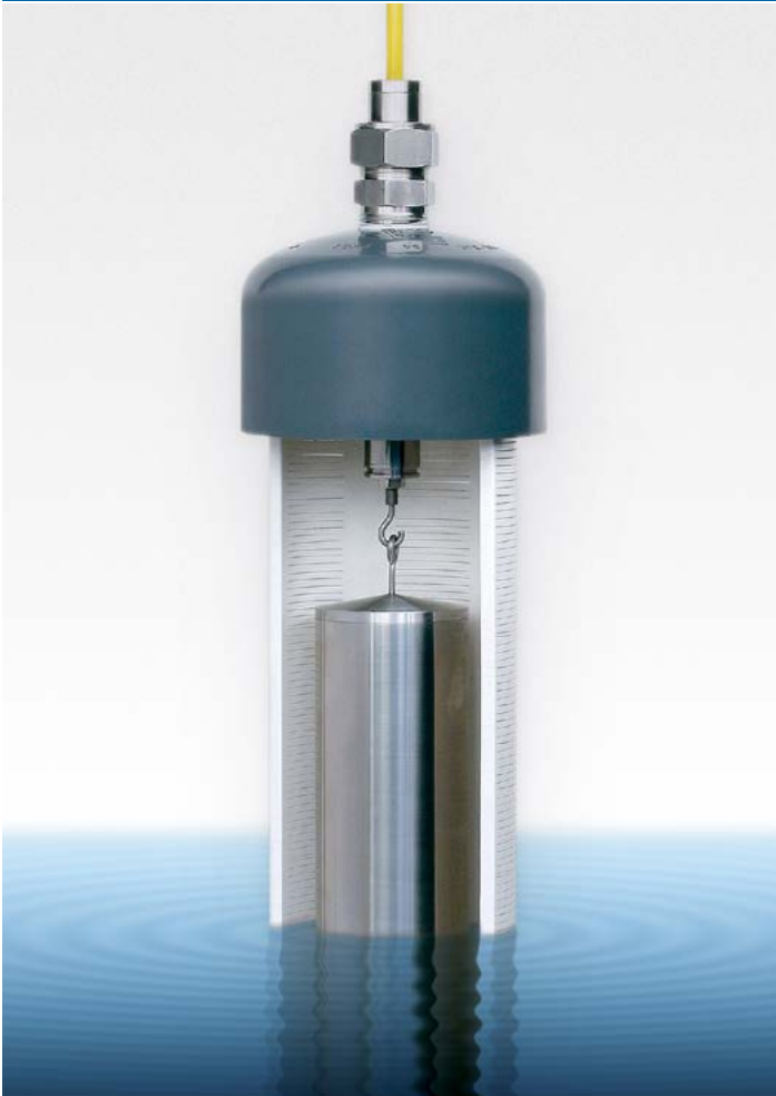
The Model 4675LV with cutaway revealing its internal components: a cylindrical weight suspended from the vibrating wire force transducer.