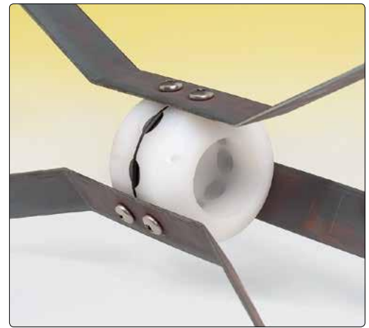
● Model 1900-7A Spider Magnet (double-ended) for 1" pipe.