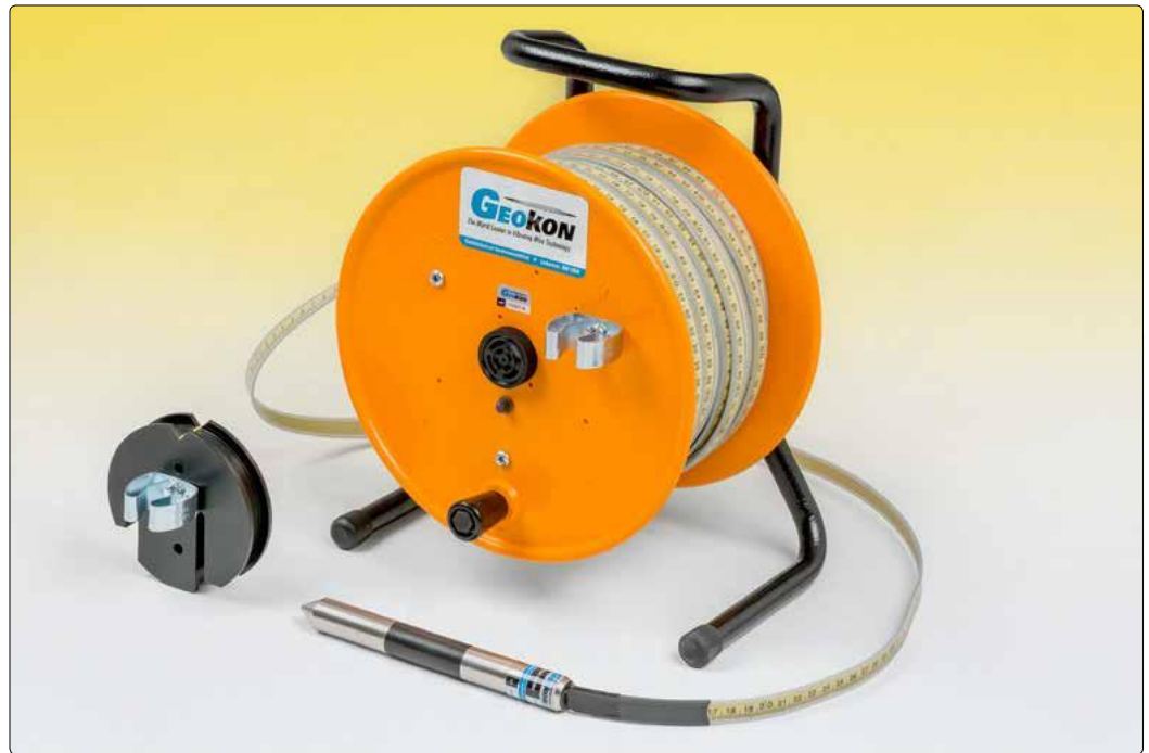
• Model 1900-11 Reed-Switch Probe and Index Marker.