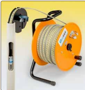
• Model 1900-11, shown with Index Mark and Reed-Switch Probe in 1" pipe.