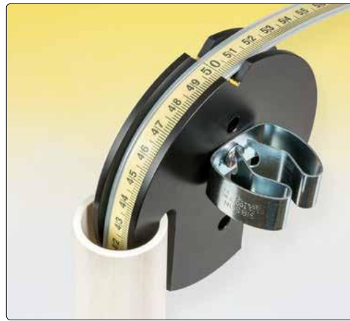
● Model 1900-11, Index Mark closure.