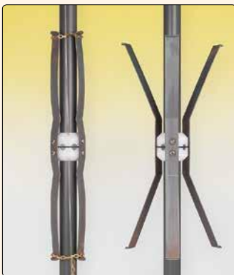
• Model 1900 Anchor, shown before and after release.