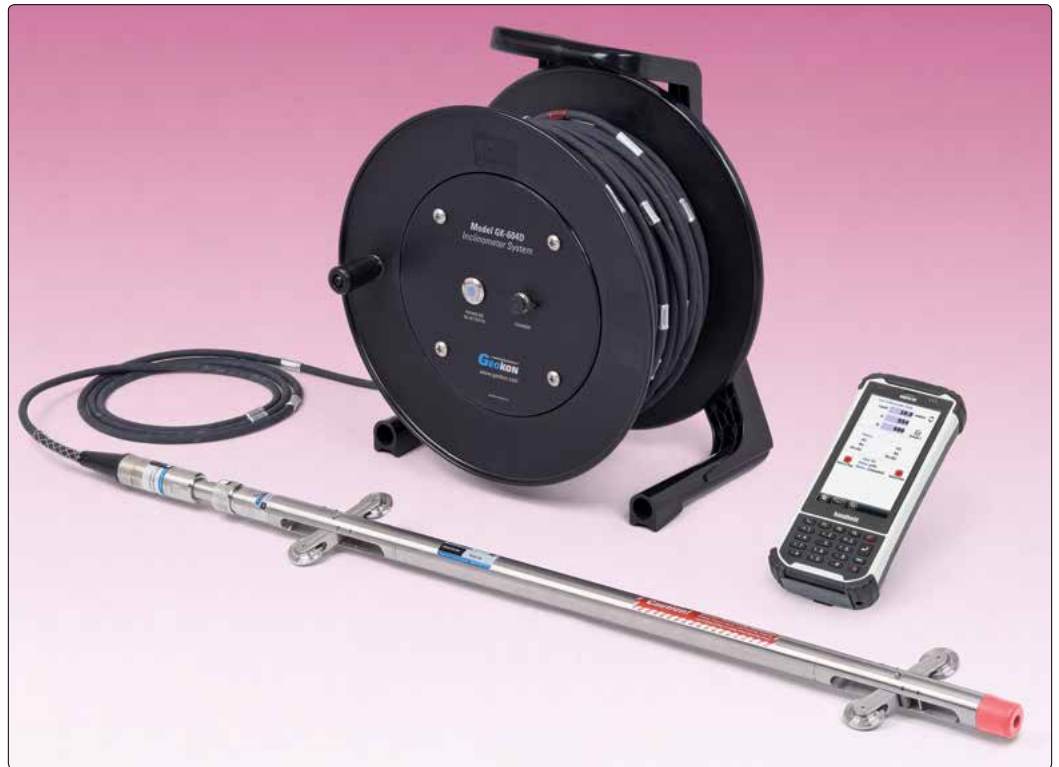
• Model GK-604D Digital Inclinator System.