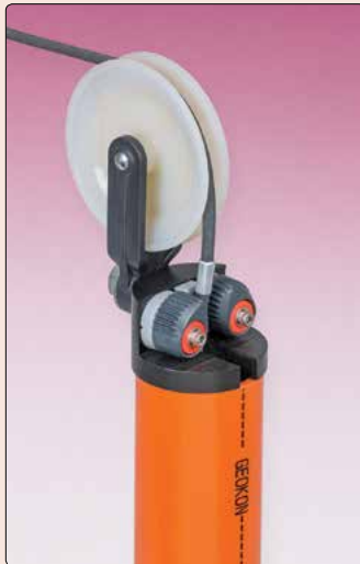
• Model 6000-20 Cable Pulley, attached to Model 6400 Inclinator Casing.