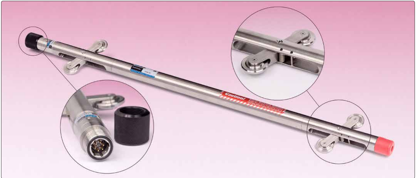
• Model 6100D Digital Inclinometer Probe.