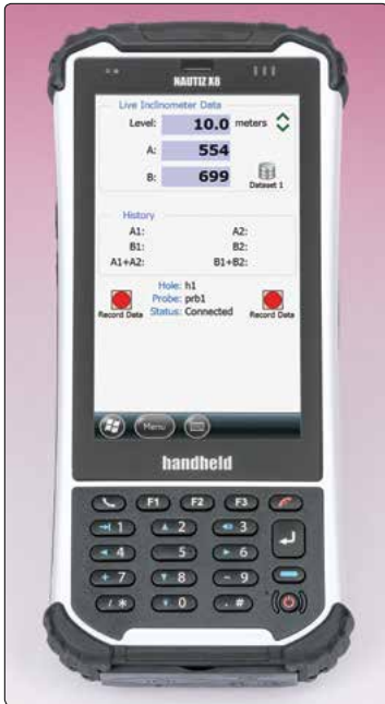
• Model FPC-2 Field PC showing a Live Inclinometer Data reading screen shot.