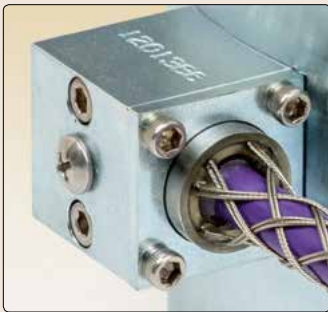
● Closeup of cable insertion showing Kellems® wire mesh grip.