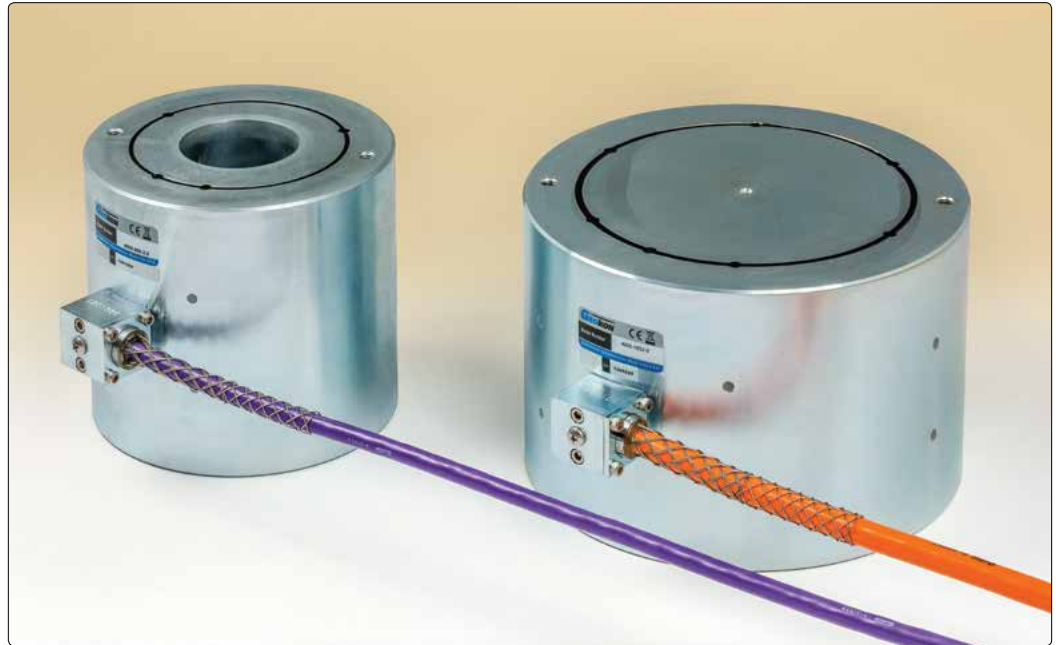
● Model 4900 Vibrating Wire Load Cells (annular and solid).