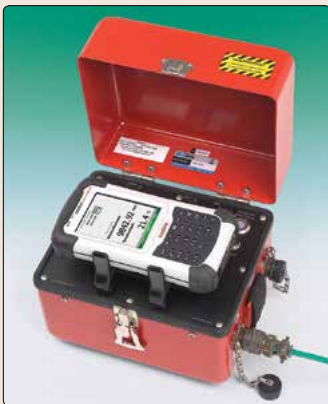
● Model GK-405 Vibrating Wire Readout for use with the Model 4900 Load Cells.