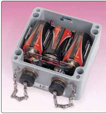
● Model 8003A-1 MEMS Datalogger shown with cover removed.