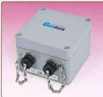
• Model 8003A-1 MEMS Datalogger.