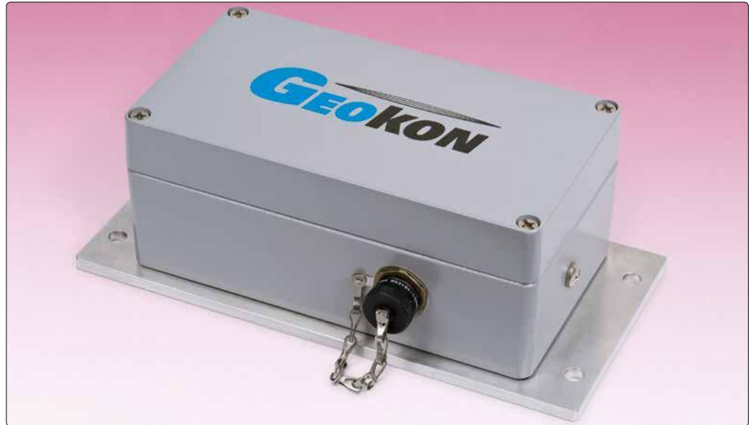
• Model 8003C-2 MEMS Datalogger.