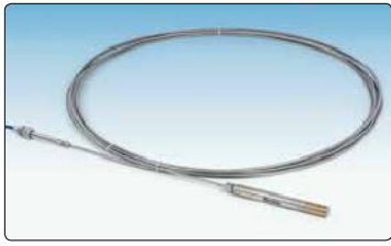
● Model 4500HT shown with TEC cable (coiled, pre-installed configuration).

are possible and the frequency output signal is not affected by changing cable resistances (caused by splicing, changes of length, terminal contact resistances, etc.), nor by penetration of moisture into the electronic circuitry. A secondary vibrating wire temperature sensor (or thermistor), located in the same housing, permits the measurement of temperatures at the piezometer location.