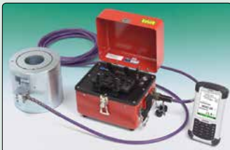
• Model GK-405 VV Readout Dock, shown with a Model 4900 Vibrating Wire Load Cell and the FPC-1 Field PC.