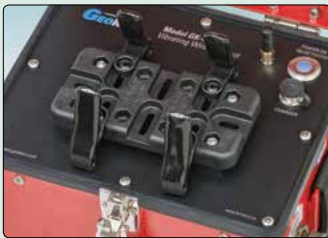
• Model GK-405 VV Readout Dock, shown with the FPC-2 Field PC removed.