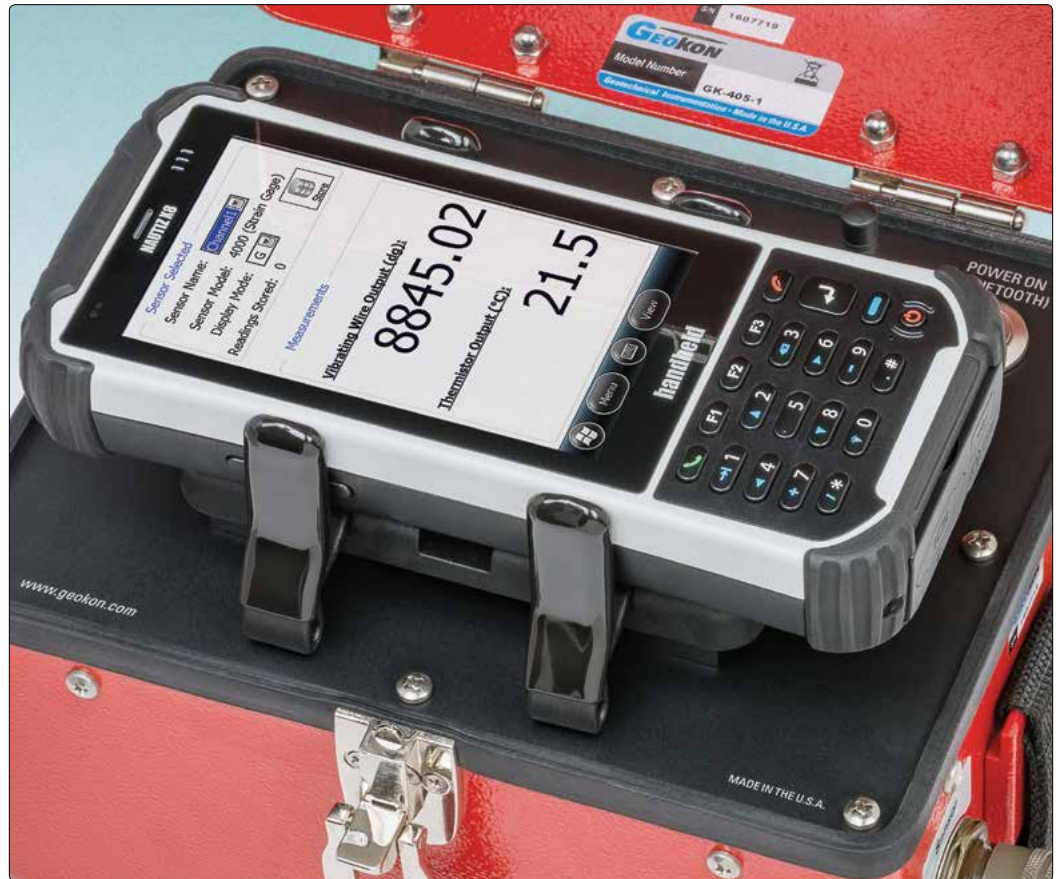
• Close-up of Model GK-405 Vibrating Wire Readout and FPC-2 Field PC placed in dock.