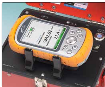
• Model GK-405 VV Readout Dock, shown with the FPC-1 (top) and Archer Field PC (bottom), both of which are compatible.