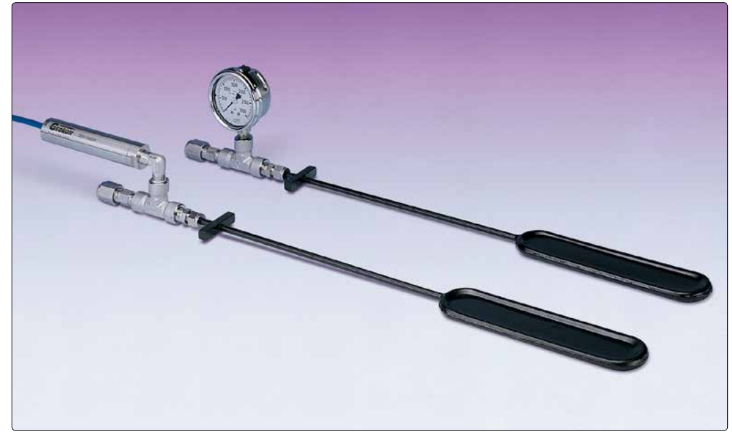
Model 3200 Hydraulic Borehole Pressure Cells pictured with pressure transducer (front) and stainless steel pressure gage (rear).