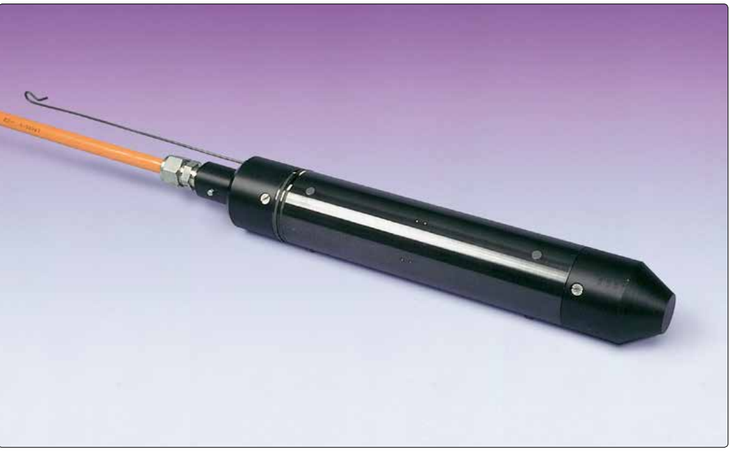
Model 4350 Biaxial Stressmeter.