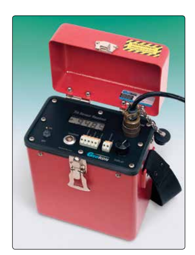
The Model RB-500 MEMS Readout for use with the Model 6160 Tilt Sensors.