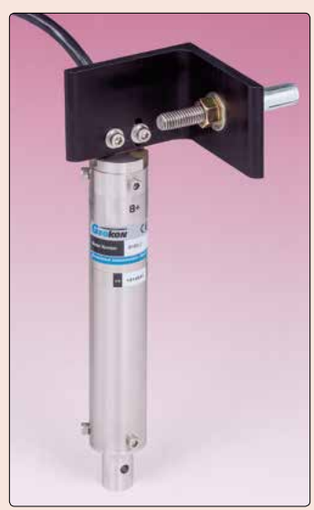
Model 6160A-2 Biaxial MEMS Tilt Sensor with mounting bracket assembly.