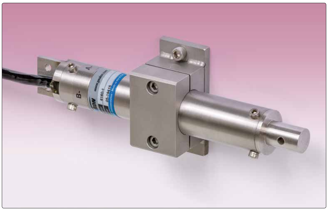
Model 6160A-1 Uniaxial MEMS Tilt Sensor with horizontal mounting bracket assembly.