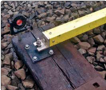
• MEMS Tilt Beam mounting attachment (with optional survey target).