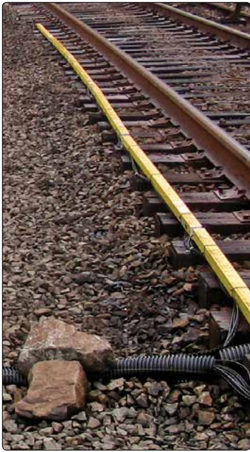
• MEMS Tilt Beam (fiberglass version) installation alongside railroad tracks.