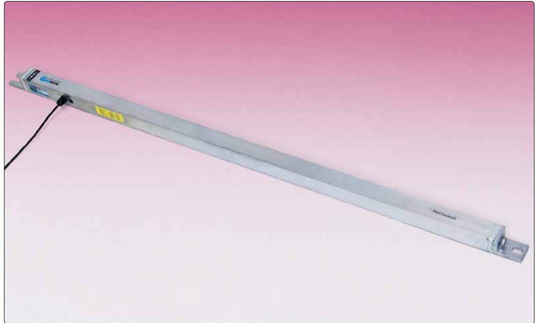
• Model 6165 MEMS Tilt Beam.