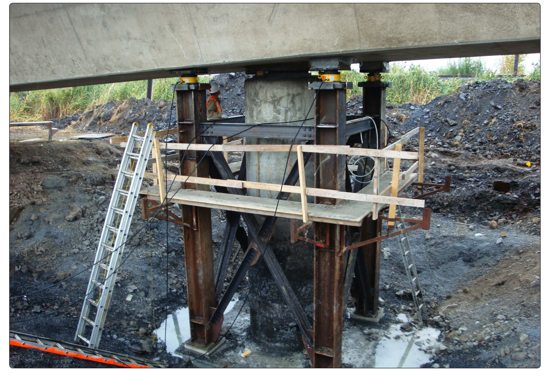
• Lifting support at Pile #2 for bearing device repair

During the rehabilitation of the P-15210 Bridge, which straddles Highway 116, north of Highway 30 in Québec, Construction Concrete Ltd. retained GKM Consultants to monitor, in real-time, the concrete deck lifting operations.