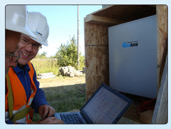
• Datalogger setup and RDMS configuration