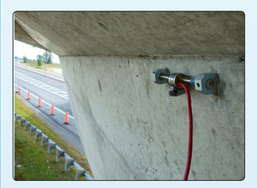
Vibrating wire strain gage installation