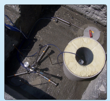
Instrumentation cluster in dam body