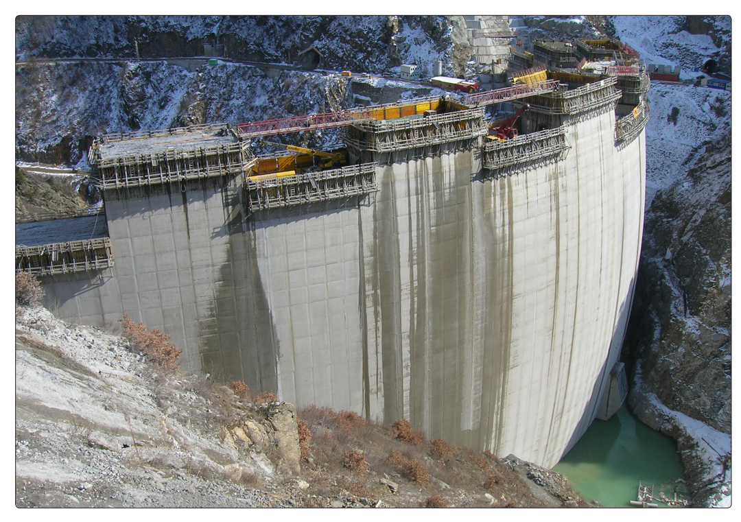
• The Tsankov Kamak Dam, Devin, Bulgaria

GKM Consultants was awarded a major contract to provide the instrumentation system for the Tsankov Kamak Dam in Bulgaria. GKM Consultants served as a sub-contractor to Alpine Bau GmbH, the primary civil contractor.