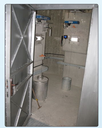
Direct & inverter telependulum stations