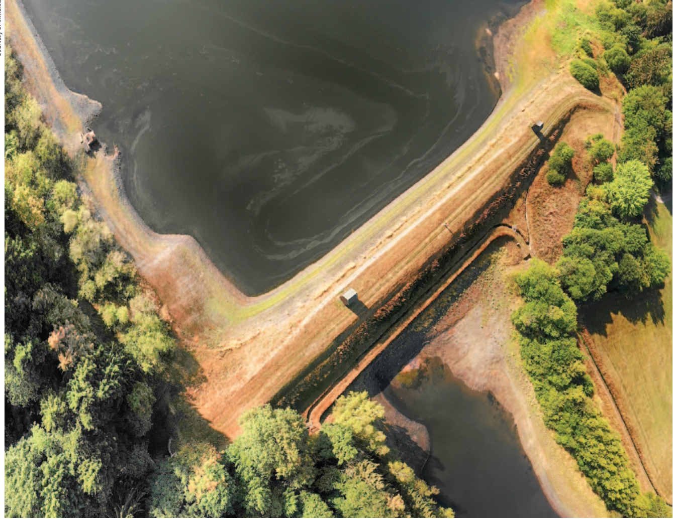
The technology to monitor dams remotely and in real-time is available, the question is whether miners are open to using it.