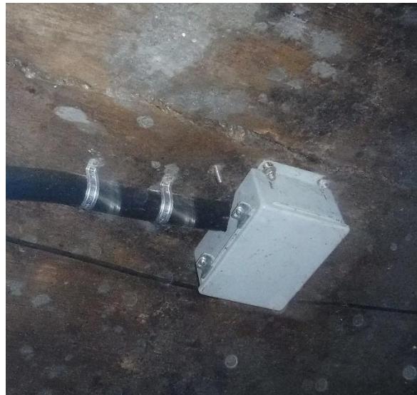
Fig. 2 : Picture of a geophone installed in a wastewater tunnel.

Due to the high water level and flow, protective equipment for the instruments had to be designed. After installation of each geophone, a metal cover was bolted on top to protect it from impacts from smaller debris and to deflect heavy debris carried by water. Geophone casings were also filled with epoxy resin to make them fully waterproof and their cables were fed into a flexible metal conduit that was bolted to the wall. This is illustrated in the picture of figure 2, where a geophone installed inside the tunnel, with the protective cover, the conduit for the cable, and one of the large cracks running alongside are displayed. Similar protection was provided to the crackmeters. This was all done because maintenance would have proven challenging: access is difficult and restricted; cables are bolted to the wall; and vision and dexterity are severely limited in the tunnel.