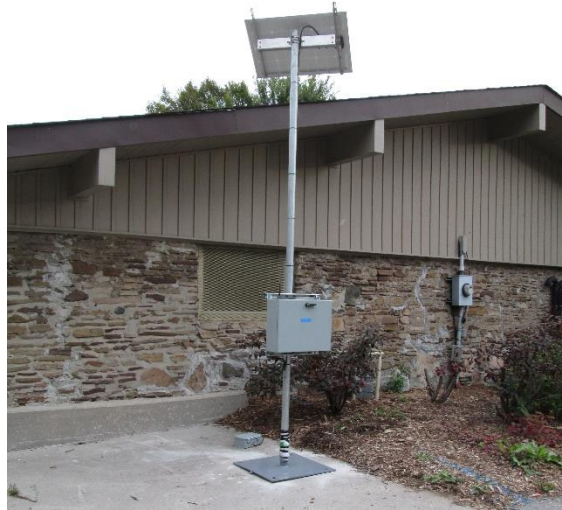
Fig. 1 : Picture of the geophone system and the historical building to be monitored.

Stations were installed at eight locations clustered around shafts and close to the historical building. The installation next to the historical building is shown in the picture of Figure 1. The assembled system is anchored to the concrete slab, and the old stone and mortar wall behind can clearly be seen. There are whiter parts in the wall where the mortar has been repaired before, showing that this building is indeed weakened and requires supplementary caution.