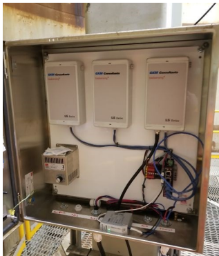
LoRa enclosure that collects data from every individual node