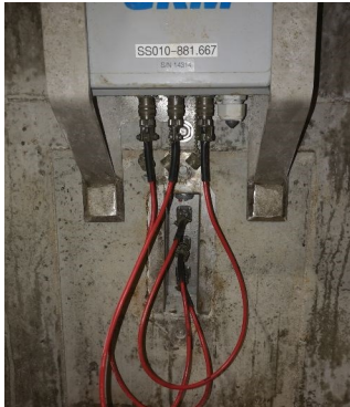
LS-Series node located 900 m underground