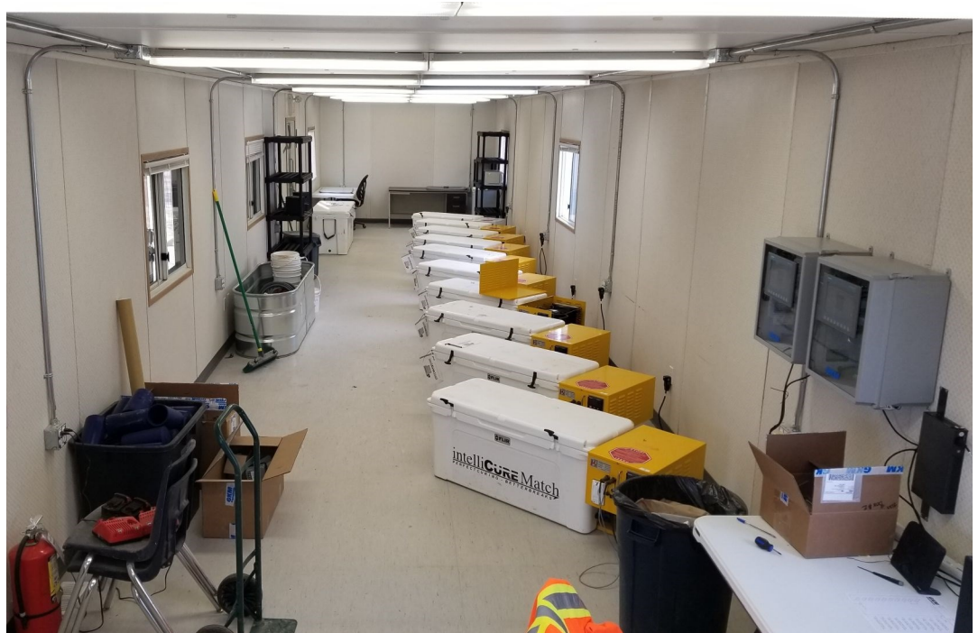
View of the warehouse where the C3 Match are located

Following up on the success of the in-shaft geotechnical instrumentation program at the Jansen mine in Canada, GKM Consultants was mandated by TRL (Thyssen-Redpath-Ledcor) and BHP to design, deploy and commission a large-scale concrete cure match system for the construction of the shaft liner. The challenge that GKM Consultants attacked head-on was that the concrete cylinders produced for quality control had to be cured at the surface at temperatures matching exactly, in real-time, temperatures measured 900 meters underground. GKM Consultants developed and introduced an innovative solution that would allow TRL to go ahead with the construction of the shafts.