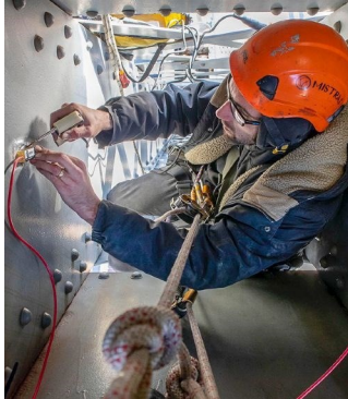
Strain gauges installation on the bridge truss.