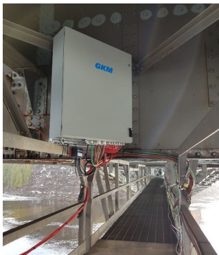
One of the two custom-made data acquisition systems installed under the Alexandra bridge.