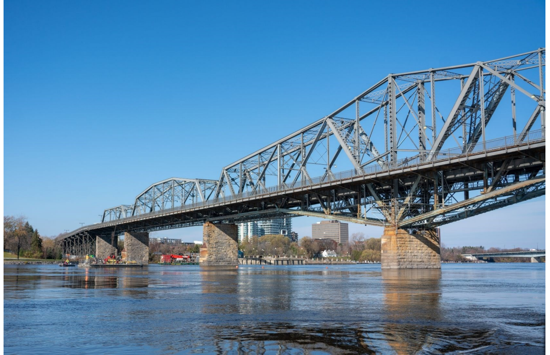
Panoramic view of the Alexandra bridge taken during the installation of our data acquisition systems.

The Alexandra Bridge connects the cities of Ottawa and Gatineau in Canada. It has been in service for over 120 years and has seen many different uses of its life leading to its' designation as a National Historic Civil Engineering Site. It has been an important feature of the Canadian capital's skyline for a long time and offers tourists and commuters beautiful views of the cities.