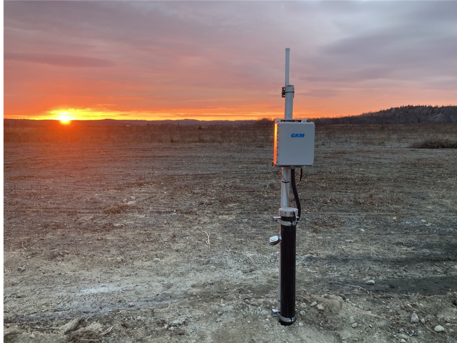
Partially remediated inactive TSF

Tailings storage facilities (TSF) are critical infrastructures related to any mine site and are an integral part of mining resource beneficiation. Risks to TSF physical (geotechnical) and chemical (environmental) stability vary greatly from one mine site to another based on several site-specific variables. One method for TSF owners to manage risk is the implementation of a structural health monitoring (SHM) program. GKM Consultants was mandated to integrate existing and install new instrumentation into one coherent TSF monitoring solution for two remote inactive and partially remediated mining sites overseen by the same operator in northern Canada. The program consists of both geotechnical and environmental components described below. As both sites are remote, isolated, and inactive this client opted for a remote SHM.