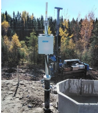
Integration of old and installation of new automated piezometers