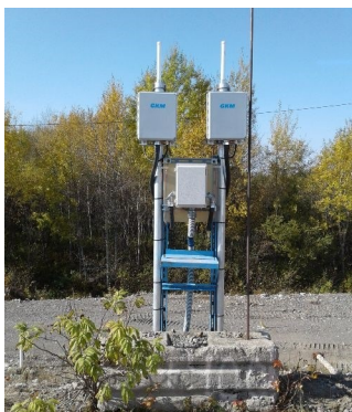
RDMS - Gateway