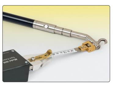
Model 1610-10 Hook Manipulator.