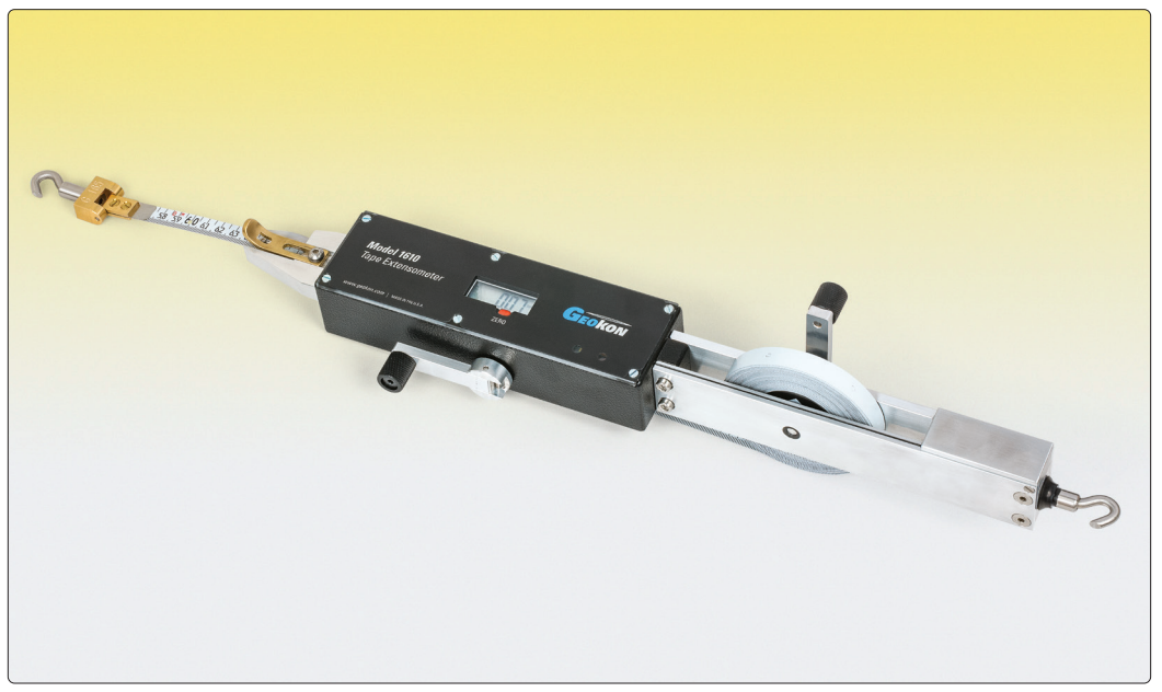
Model 1610 GEOKON/Ealey Tape Extensometer.