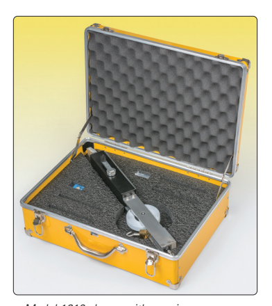
Model 1610 shown with carrying case.