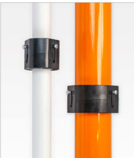
Model 1900-5A (left) and Model 1900-5B (right) Datum Ring Magnets.