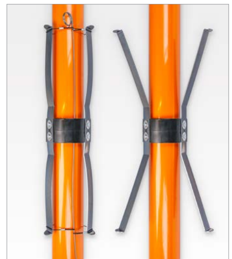
Model 1900-7B Anchor, shown before and after release on 6600 Inclinometer casing.