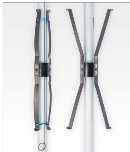
Model 1900-7A Anchor, shown before and after release on 1" access tube.