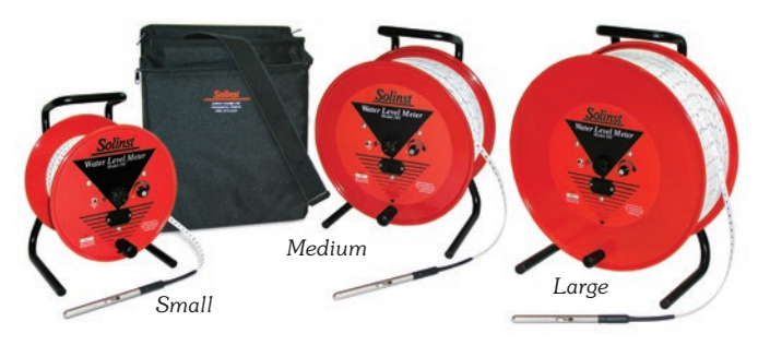
Model 101 Water Level Meter Reels

* Polyethylene tapes are only available in these lengths