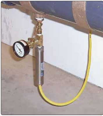
• Model 3400H and Dial Gage Pressure Transducer on a tee fitting.