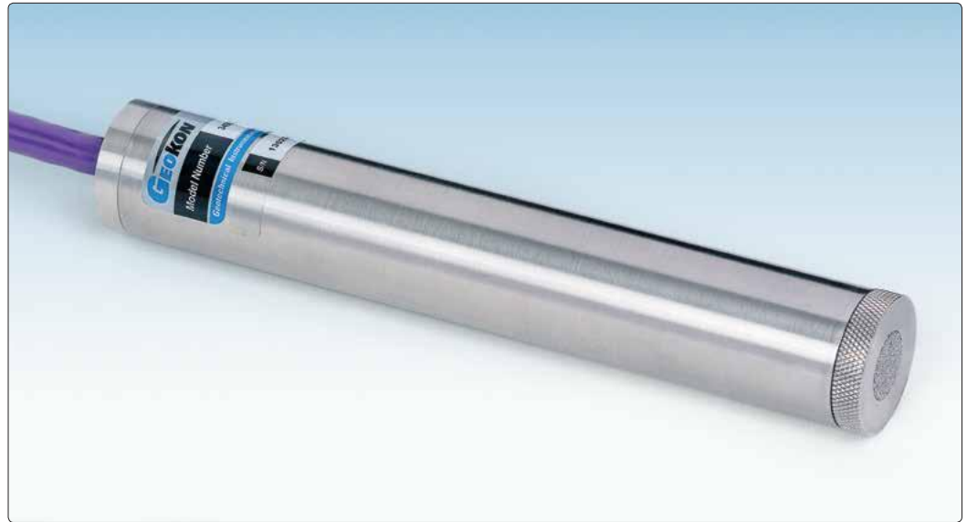
• Model 3400S-1/2 Semiconductor Piezometer.