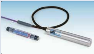
• Model 3400SV-1/2 Semiconductor Vented Piezometer.