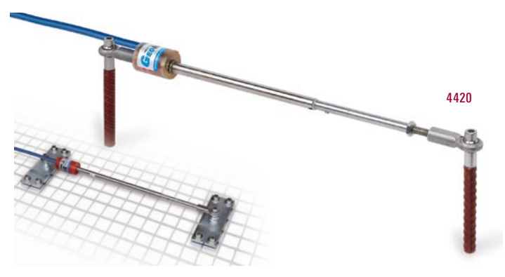
Model 4420 Crackmeter (inset: configured with special clamps for attachment to geogrids).

Special versions of the Model 4420 are offered including low profile models (Model 4420-3); versions for underwater use, where water pressures exceed 1.7 MPa; and versions for use in cryogenic or elevated temperature regimes (please contact GEOKON for details).