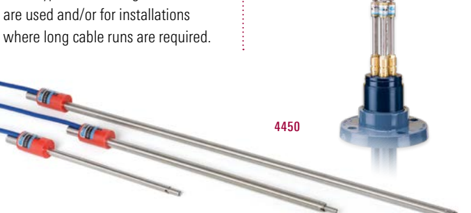
Model 4450 Displacement Transducers and Extensometer Head Assembly (inset).

The Model 4450 can also be installed between borehole anchors, in conjunction with the requisite length connecting rod, to provide a permanent, in-place incremental extensometer (contact GEOKON for details).