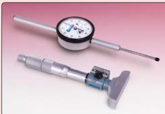
• Model 1400-1 Dial Indicator (top) and Model 1400-4 Digital Depth Micrometer.