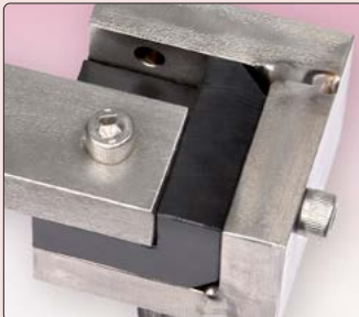
• Closeup showing alignment blocks, used during installation, for correct spacing.