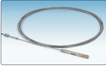
● Model 4500HT shown with TEC cable (coiled, pre-installed configuration).

are possible and the frequency output signal is not affected by changing cable resistances (caused by splicing, changes of length, terminal contact resistances, etc.), nor by penetration of moisture into the electronic circuitry. A secondary vibrating wire temperature sensor (or thermistor), located in the same housing, permits the measurement of temperatures at the piezometer location.