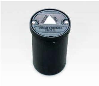
Typical well cover.