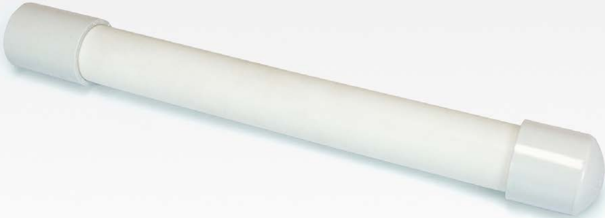
Model 4590 Casagrande Piezometer.