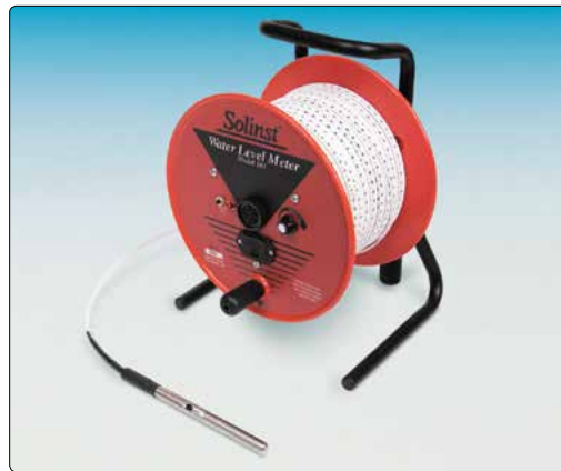
• Solinst Model 101 Water Level Meter.