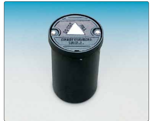
• Typical well cover.*