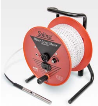
Solinst Model 101 Water Level Meter.