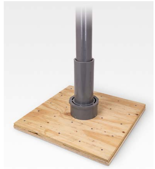
Model 4625-5SPA Slip Coupling for Protective sleeve