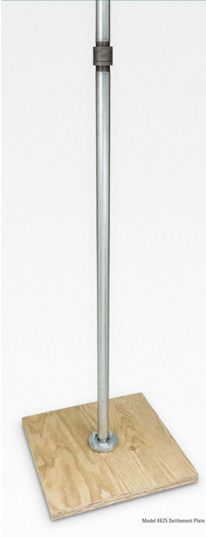
Model 4625 Settlement Plate