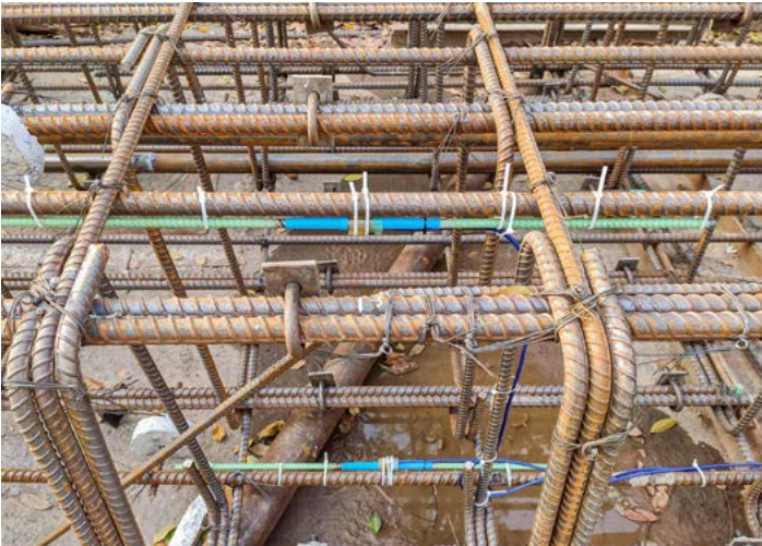
Close-up of Model 4911 shown as in-stalled in concrete pile reinforcing cage.