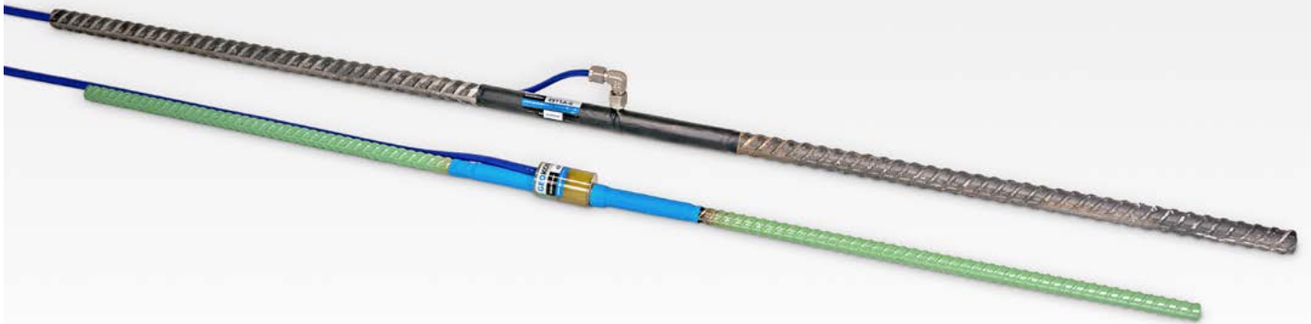
Model 4911 "Sister Bar" (front) and the Model 4911A Rebar Strainmeter (rear)