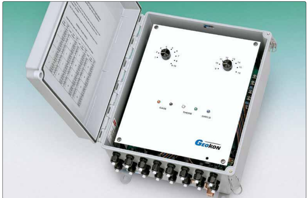
• Model 4999-16VTS Terminal Box.