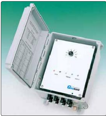
● Model 4999-11-8S