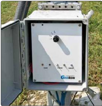
● Model 4999-11-4S