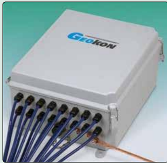
• Model 4999-16VTS Terminal Box.