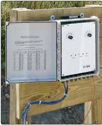
● Model 4999-16VTS