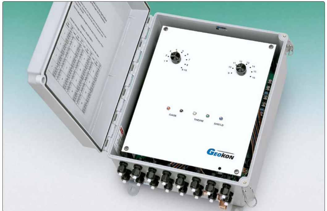
• Model 4999-16VTS Terminal Box.