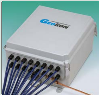
• Model 4999-16VTS Terminal Box.