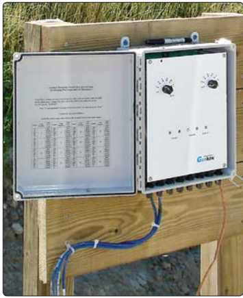
● Model 4999-16VTS