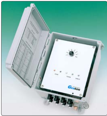
● Model 4999-11-8S