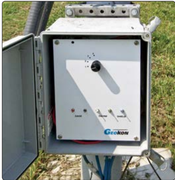
● Model 4999-11-4S