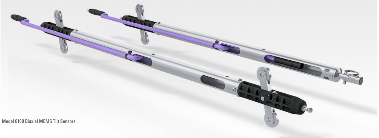
Model 6180 Biaxial MEMS Tilt Sensors.