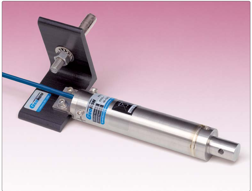
• Model 6350 Vibrating Wire Tiltmeter shown with mounting bracket assembly.