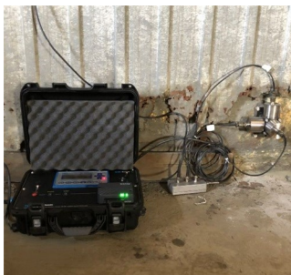
SVi minimate pro accelerometer