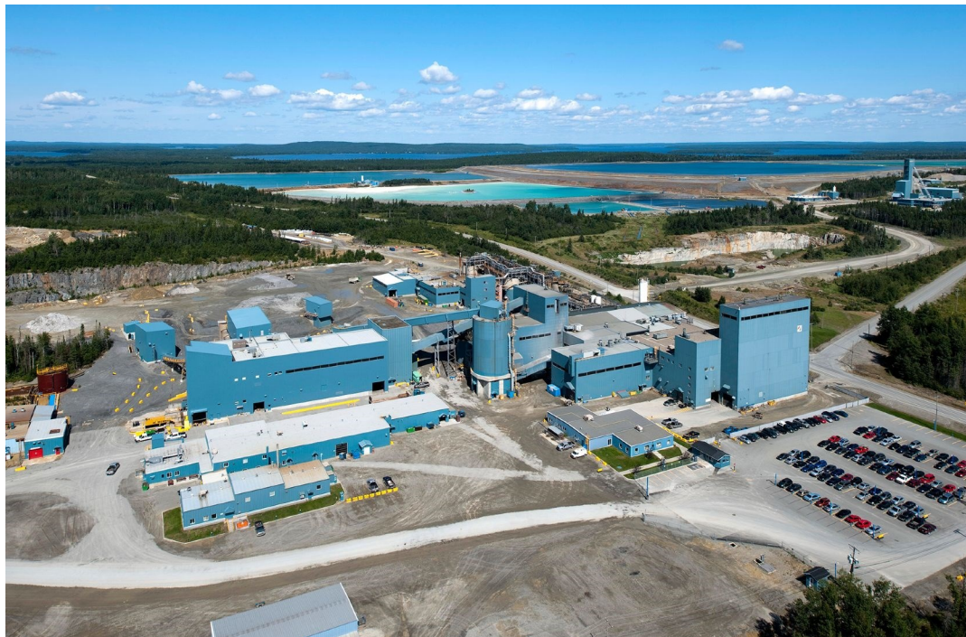
Aerial view of LaRonde Mine, owned by Agnico Eagle Mines | Abitibi-Témiscamingue