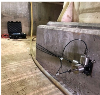
Installation SVi minimate pro accelerometer