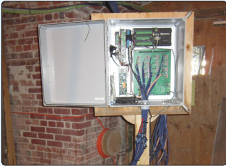
• Automated data acquisition system for telemetry