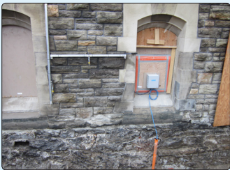
• Horizontal and vertical tilt beams and in-place inclinometer on the inner courtyard