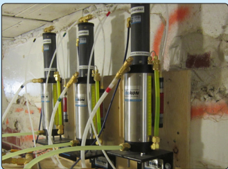
• Reference point for differential settlement measurement system