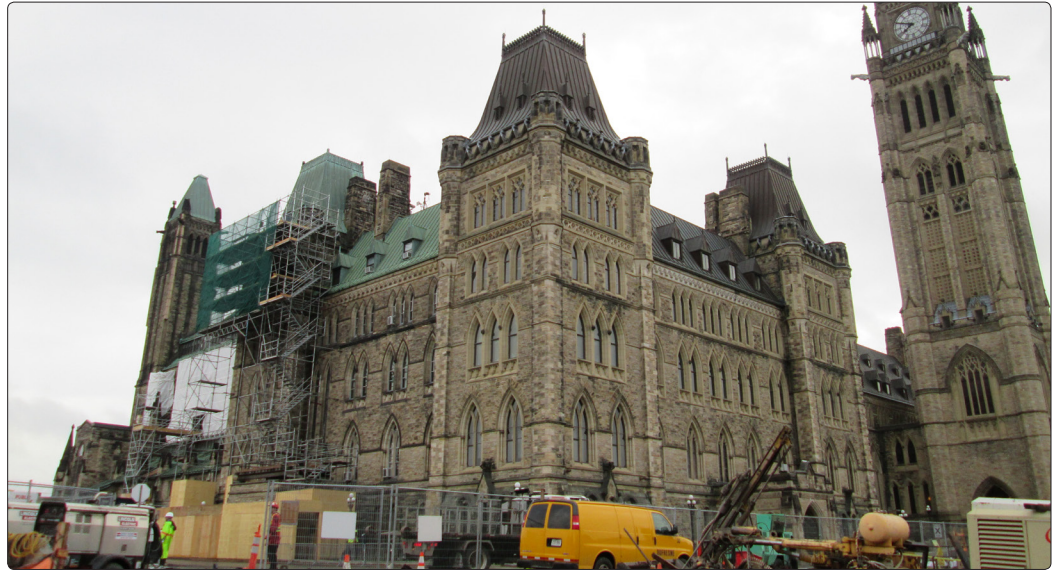
• View of the worksite at Parliament Hill's West Block

The year 2017 marks the 150th anniversary of Confederation. Amidst the preparations for the celebrations, several infrastructure projects have been undertaken in Ottawa, including the rehabilitation of the Parliament Hill Buildings. The project is a major overhaul intended to modernize the West Block, the Centre Block and the East Block while maintaining their heritage look. Given that the Parliament Hill Buildings are over 150 years old, the goals in modernizing them are both structural and aesthetic. GKM Consultants' instrumentation services were entrusted with the long-term monitoring of the West Block.