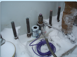
• Load cells installation on anchors