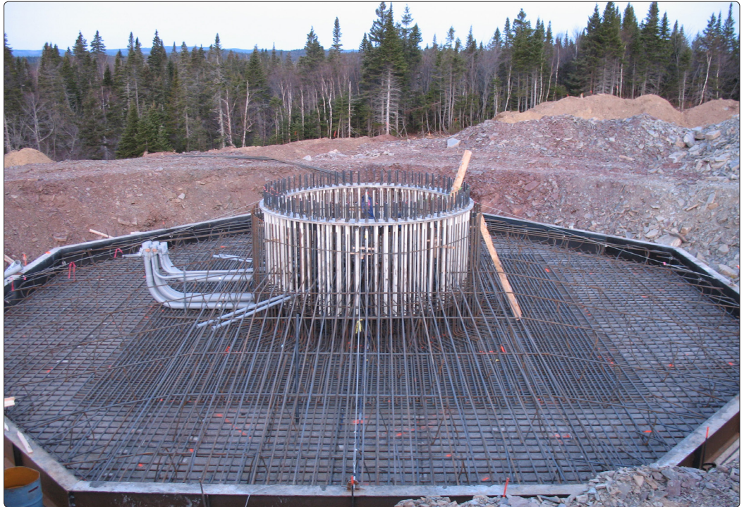
• Foundation steel pad reinforcement, anchors and tower instrumentation

SNEEC Eolien Corus is the “Wind Nordic Experimental Site” located in the Gaspé region. They assess turbine performance in relation to weather effects in Québec. The purpose of this instrumentation pilot project is to understand the structural behavior of its tower concept in cold weather conditions.