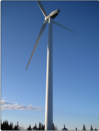
• 80 meter T-2 Wind turbine view